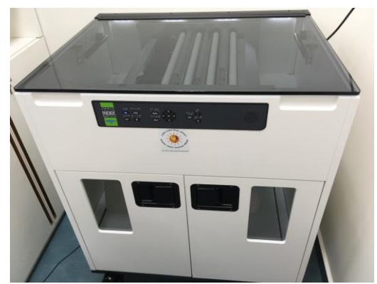
(Left) A training workshop at XRCVC Viviana Extension; (right) the new, heavy-duty Index Braille Embosser at XRCVC

Our membership base expanded to 587 persons during the year. We were also able to touch—and hopefully transform—thousands of lives across the country through our advocacy work, particularly in the areas of education access, financial access, print access and independent living (see section sub-titled 'Advocacy').