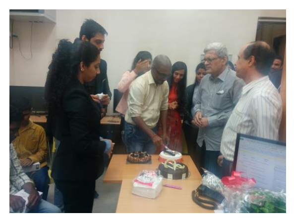
(Left) A sensitisation workshop at BNY Mellon, Pune; (right) first anniversary celebrations at XRCVC-Viviana Extension