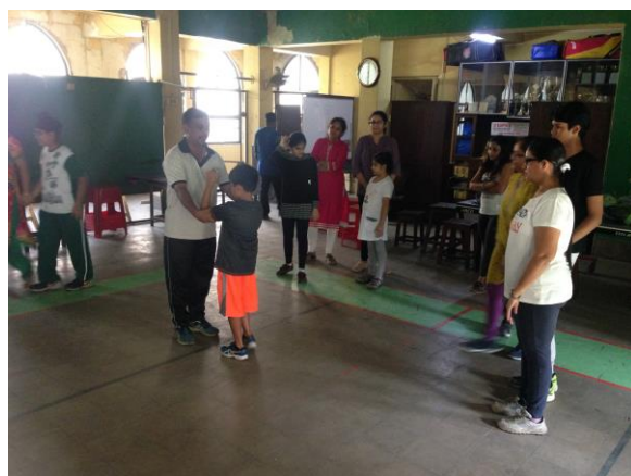
Trekking and indoor training sessions conducted by the XRCVC Recreation Club

Besides, the XRCVC team organised and participated in many sports activities during the year.