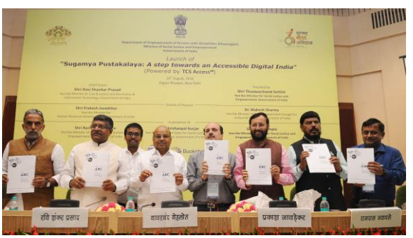
(Left) A workshop at XRCVC Viviana Extension; (right) the release of 'The ABC of Inclusive Publishing' by HRD Minister Prakash Javadekar during the launch of Sugamya Pustakalaya in Delhi