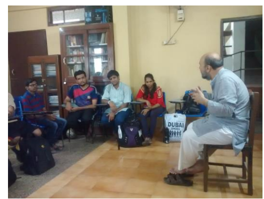
(Left) A team from UGC visits XRCVC; (right) a class in language and communication skills at St Xavier's College