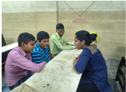
(Left) Maharashtra's education minister Vinod Tawde visits XRCVC; (right) a science excitation workshop at St Xavier's